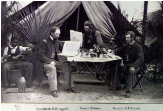
The Valley of the Shadow paved the way for digital archives by putting Civil War images, letters, and manuscripts online.