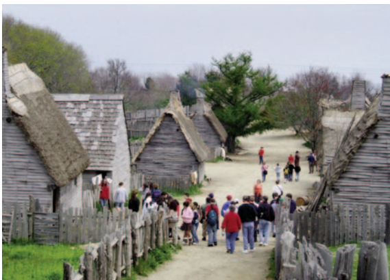
Plymouth Plantation relies on archaeological and historical research to interpret the history of the seventeenth-century colony for its visitors.