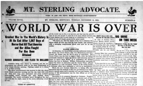
Chronicling America digitizes and makes accessible historical newspapers from every state.