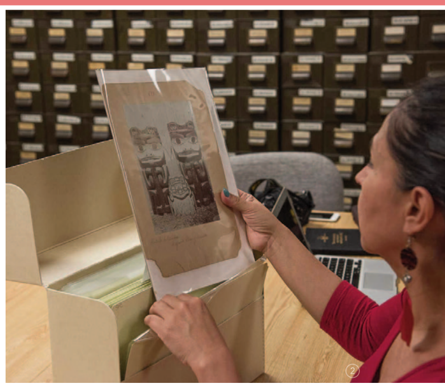
Clockwise from top left: (1) Scholars are digitizing Ka Leo Hawai'i for online listening. (2) A Haida participant at the National Breath of Life Archival Institute in 2017. (3) A Northern Paiute participant at the National Breath of Life Archival Institute in 2019.